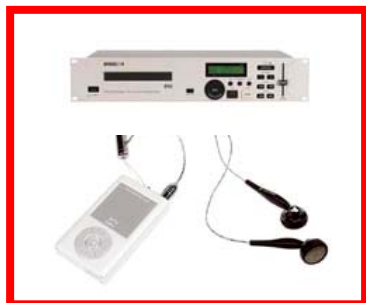
CD player MP3 player...